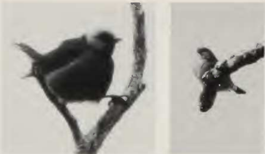
FIG. 5. 'O'u ( Psittirostra psittacea ) male (l.) and female (r.). See also Frontispiece.

Krakowski, who heard an 'o'o calling on 28 and 29 April 1987 (Pyle 1987). A survey by state agency biologists in February of 1989 found no 'o'o, and the report speculated that the birds were "now probably gone" (Pyle 1989). They have not been reported since and are undoubtedly extinct, their loud vocalizations being difficult to overlook.